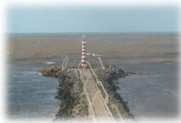
Las Escolleras Coatzacoalcos