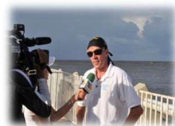
Steve Black of Australia World High Diving Champion 2008 winner of 8,000 USD