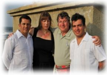
LQHDP & WHDF / Directors