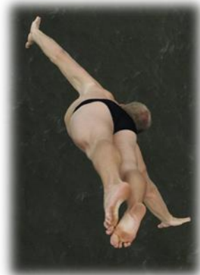
Eguil Ormarson Island