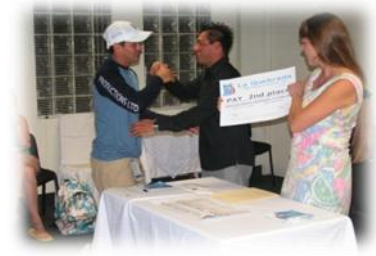
Price Money 2 nd place