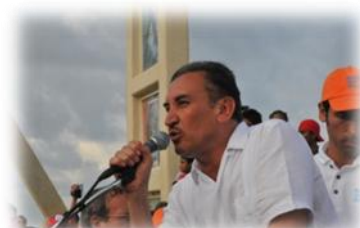
Alcalde Marcelo Montiel