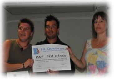
Price Money 3 rd place