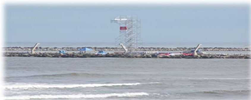
Diving platform 25mtr. / Scaffolding construction/ Las Escolleras Pear.