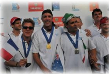
World diving champions 2008