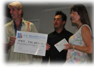
Price Money 1 st place